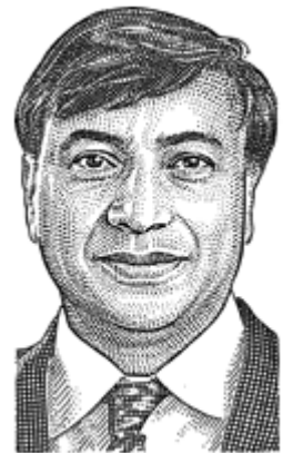
Lakshmi N. Mittal